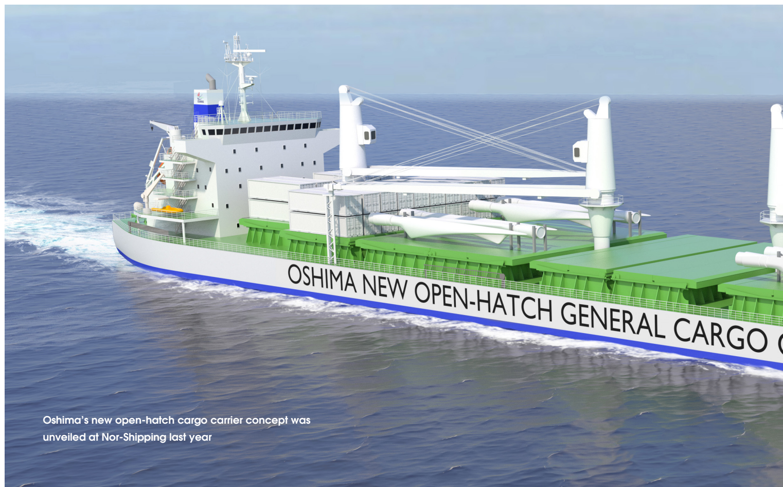
Oshima's new open-hatch cargo carrier concept was unveiled at Nor-Shipping last year

The new vessel concept draws heavily from the Oshima ECO-Ship 2020, a 2011 JDP between Oshima and DNV (prior to its merger with GL), and utilises a number of established technologies. However, while the vessel is a ready-to-