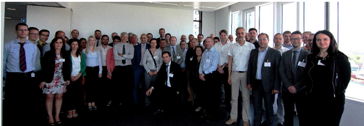
Figure 1: Project Kick-Off Meeting, 21-23.06.2017 in Hamburg

New materials – be it composites or high performance metallic materials – can help making ships and maritime products lighter, more cost efficient, more environmentally friendly and safer. However, to qualify innovative materials for maritime applications, they need to cope with extreme operational scenarios and environmental conditions. Moreover, to be cost efficient they need to be integrated in multi-material ship structures as well as into complex building and global repair, retrofitting and dismantling processes.